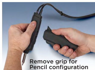
Remove grip for Pencil configuration

The MFR-1150 system includes a Desoldering Pistol with an easy to change, large capacity solder collection chamber to ensure minimum downtime. The pistol can easily be converted to a pencil grip for additional control. Metcal offers a wide range of long life desoldering tips that will keep your equipment working efficiently.