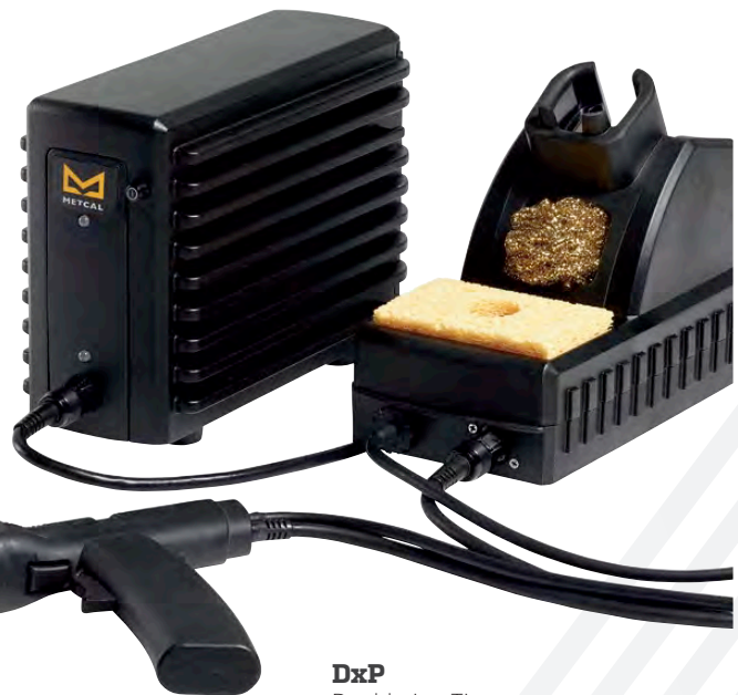
DxP Desoldering Tips