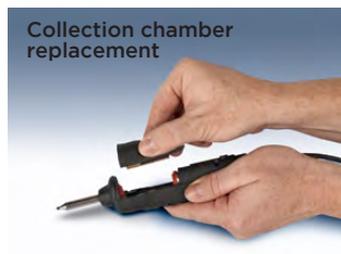
Collection chamber replacement