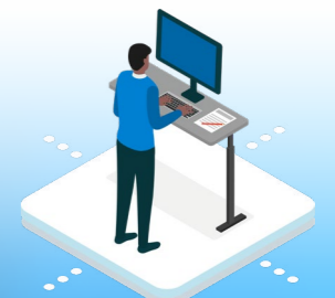
System can be controlled remotely.