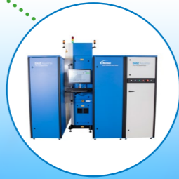
Modules fit together.